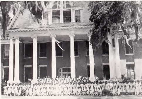
Pictured above are 4-H Club Council members from the 4-H Summer Camp at Dublin, Georgia. The group toured the campus and the city of Savannah.