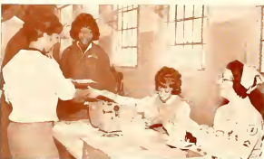
Students helping to make Savannah State College's Blood Drive a success by donating a pint of blood each.

Having decided to produce coins that contain less silver, the U. S. Treasury faced the awesome problem of altering millions of vending machines so they'd accept the new coins—a two-and-a-half-year job—or of trying to perfect a coin that the machines would accept as genuine.