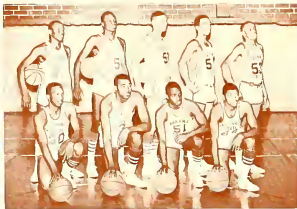
Savannah State College Basketball Team.