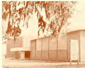
Wiley-Wilcox P.E. Complex. This physical education facility includes a swimming pool, classrooms, and additional spectator seating for indoor sports.