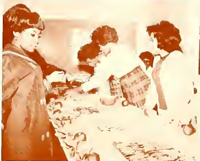
Students supported the Home Economics Department's annual Christmas Bazaar in order to make it a success.