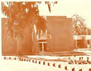
William K. Payne Classroom Building. This classroom building houses a foreign language laboratory and several air conditioned classrooms and offices.