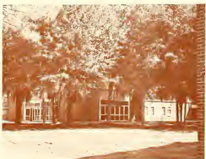
Lockette Dormitory, which houses 180 women students, is located on Taylor Road, south of Powell Hall.